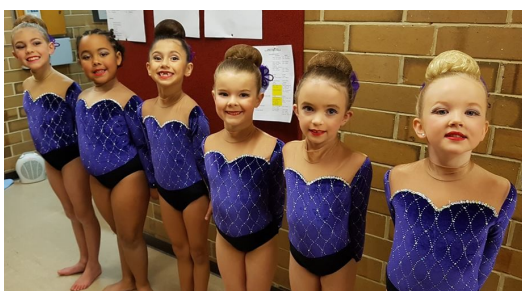
Tinies Gold March—4th