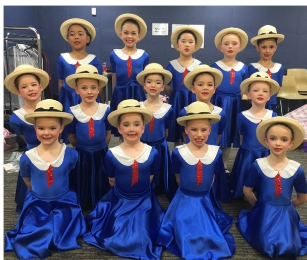
Tinies White and Gold Exercises—2nd Character Folk—2nd