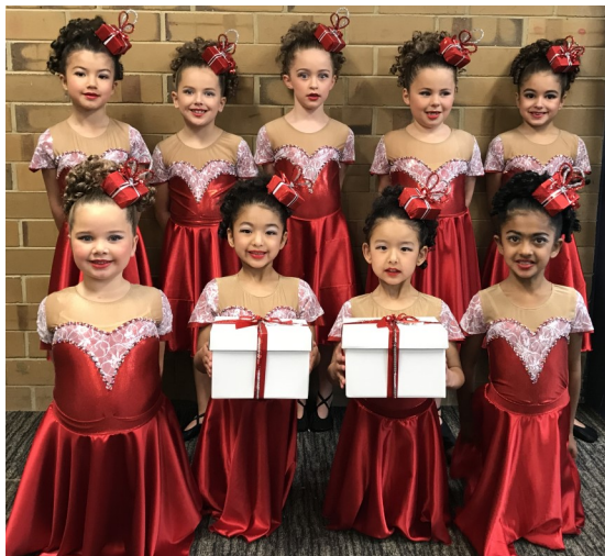
Tinies Navy Exercises—3rd Rods—3rd Character Folk—3rd