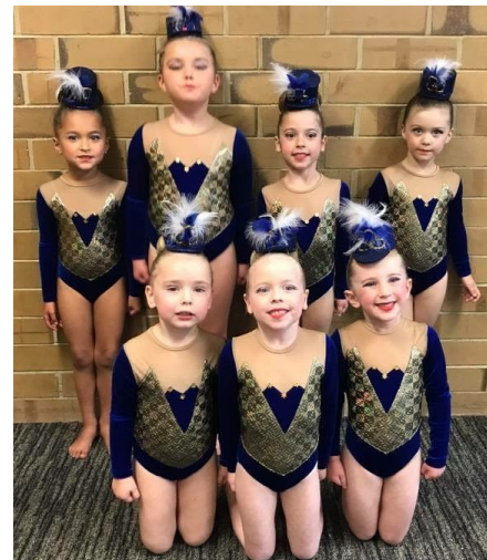
Sparkles Demonstration Team