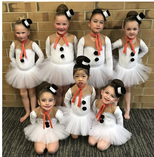
Tinkerbells Demonstration Team

Congratulations to all 37 Tinies who performed at the Innovation Competitions. What superstars!