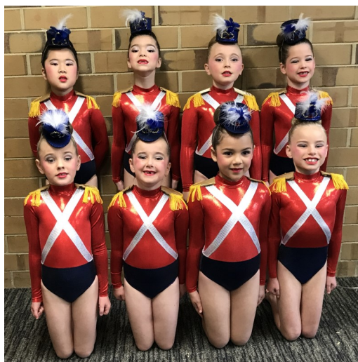
Tinies White March—2nd Rods—1st